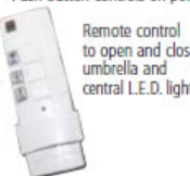
Remote control to open and close umbrella and central L.E.D. light