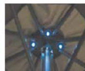
Built-in L.E.D. lights in hub