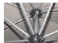
Quality double spring loaded pulley system