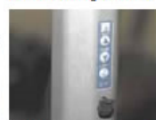
Push button controls on pole