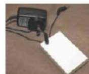
Battery charger and bonus spare back-up battery power pack