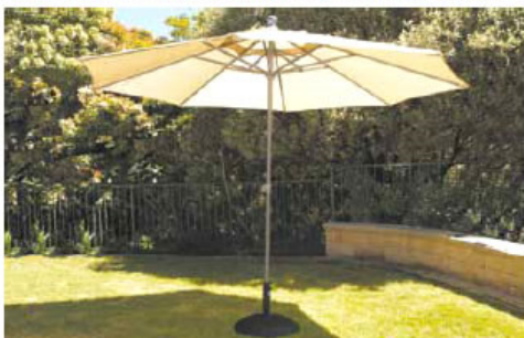
Breeze 3.0 metre Octagonal (6.7 sq m) 1 piece 38 mm pole powder coated aluminium framed umbrella. The unique telescopic pole lowers arms on opening and raises arms on closing. (Great for use over tables).

Windward wind-up crank lift handle in 'brushed' aluminium to open and close umbrella.