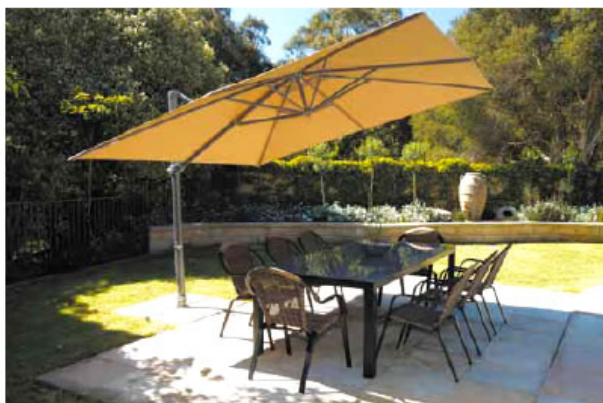
Jet Stream 3.0 metre Square (9.0 sq m)

Optional resin base with retractable wheels. Fill with stone ballast.