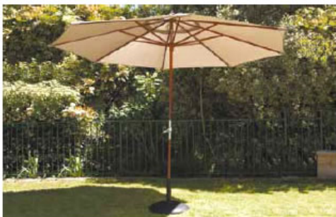
Windward 3.0 metre Octagonal (6.7 sq m) Timber framed umbrella with 2 piece 38 mm timber pole with 'brushed' cast aluminium connector and winder.

Sea Breeze wind-up crank lift to open and close umbrella. Tilt to any variable angle up to 20 degrees by rotating collar on winder housing.