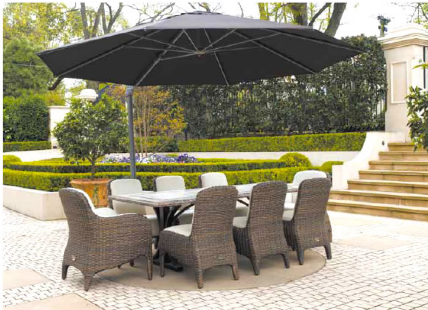
Jet Stream 3.5 metre Octagonal (9.2 sq m)