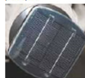
Solar powered charger on top of umbrella as alternative power supply