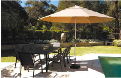
Sea Breeze 2.7 metre Octagonal - (5.5 sq m) and Sea Breeze 3.3 metre Octagonal (7.9 sq m) 2 piece 38 mm pole with button lock. Frame in silver anodised finished aluminium.